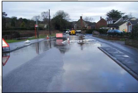
Surface water and river flooding (FLOD)