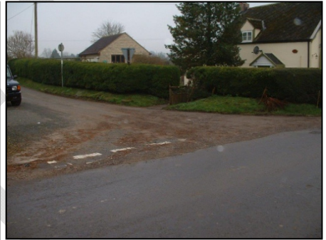
Debris in road (DEBR)