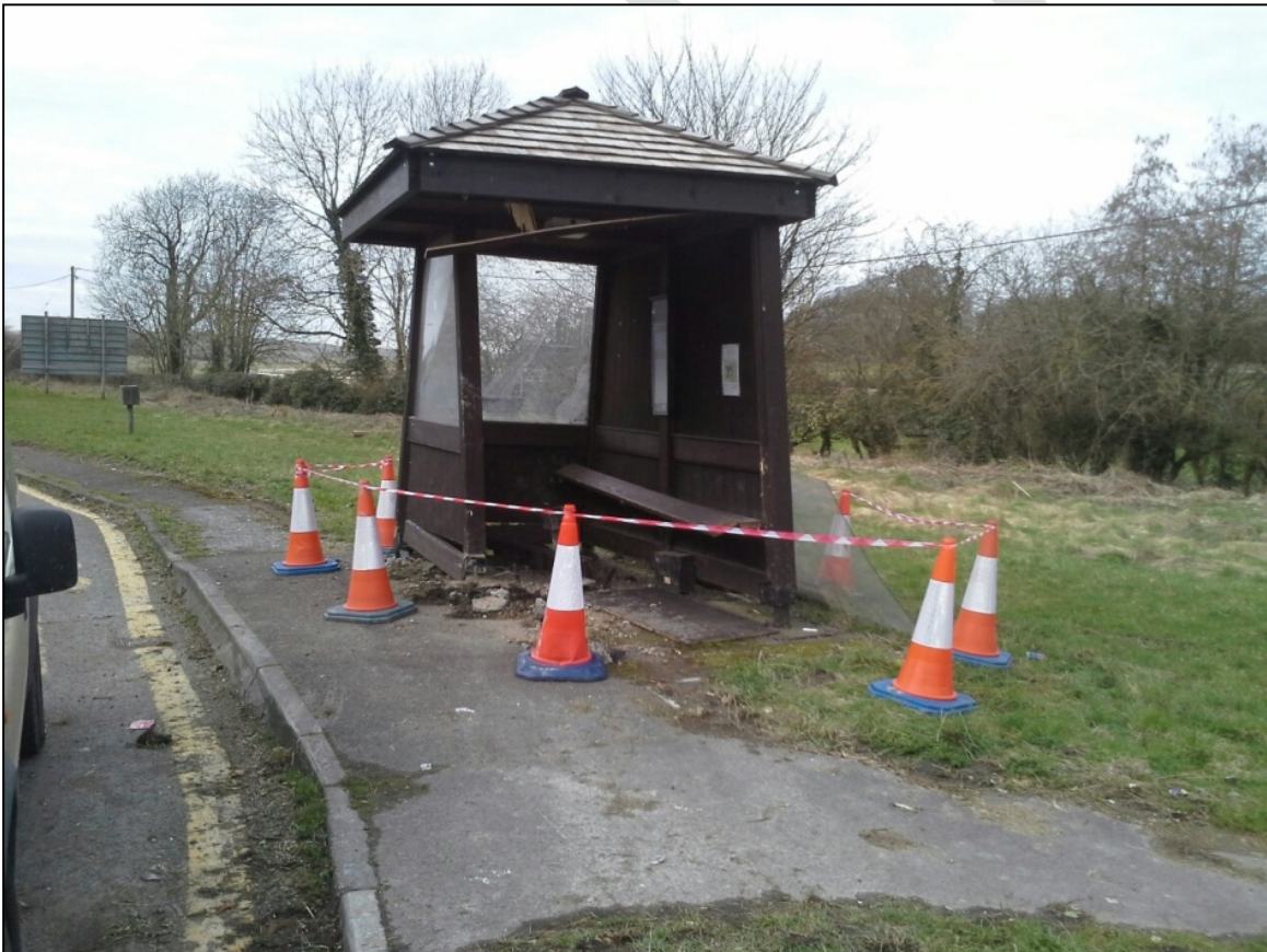
Street furniture structural damage (DAST)