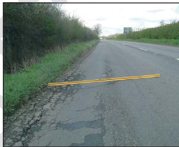
Depression in carriageway (DEPR)