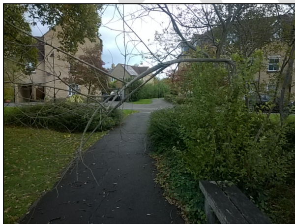
Footway obstructions (OTHR)