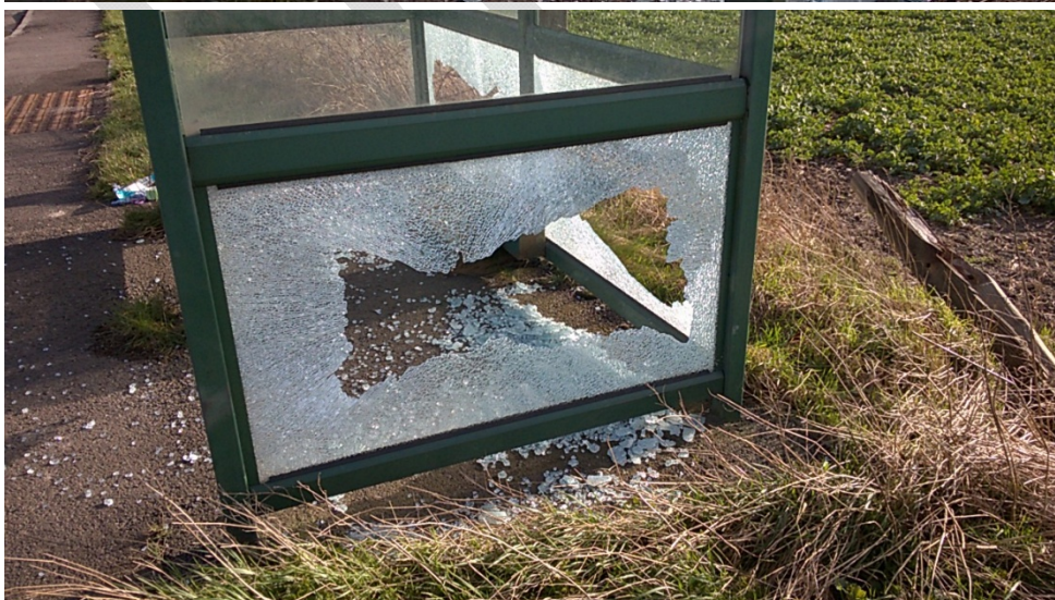
Damaged with Broken Glass or Sharp Edges (BRGL)