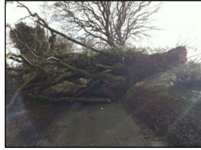
Fallen tree (OTHR)