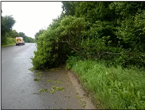
Fallen tree (OTHR)