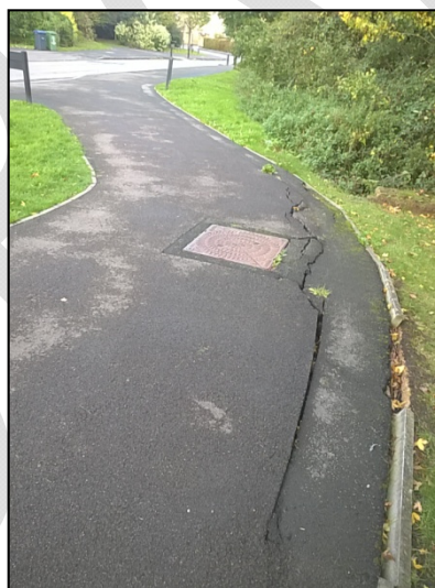
Footway cracks and gaps (MACK)