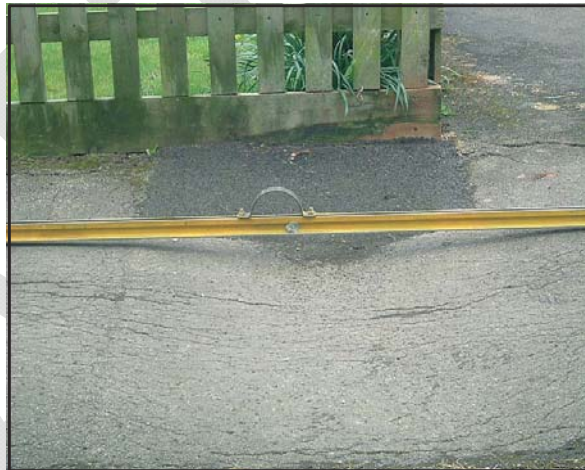
Depressions in footway (DEPR)