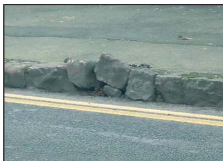
Kerb vertical projection, damaged or missing (EVPJ, DAMG, MISS)