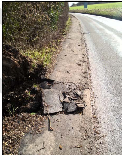
Footway potholes (POTH)