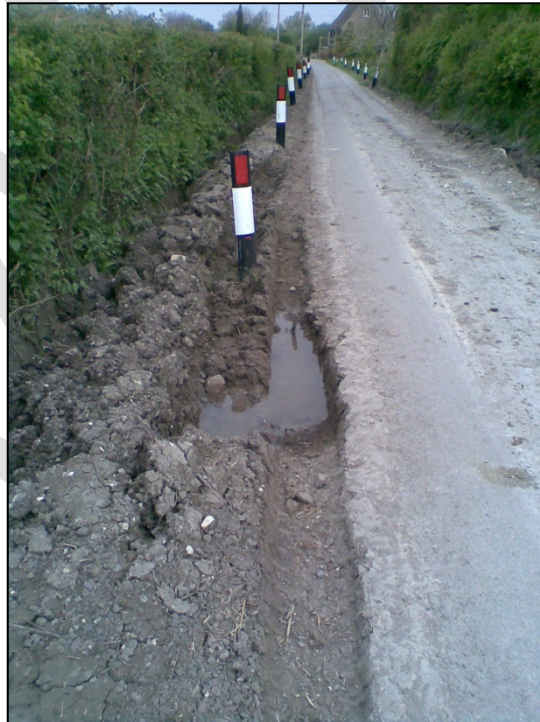
Verge Over-run (ORUN)