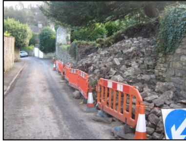
Structural failure (STRU)