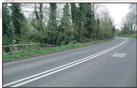
Guard rail or safety fence damaged (DAMM)