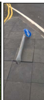
Signs damaged in collisions (ACCD)