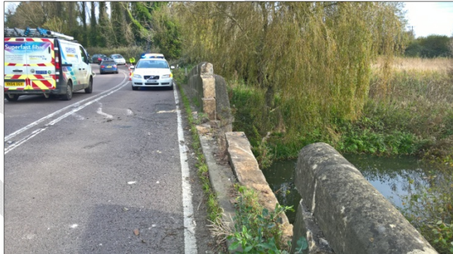
Structural damage (STRU)