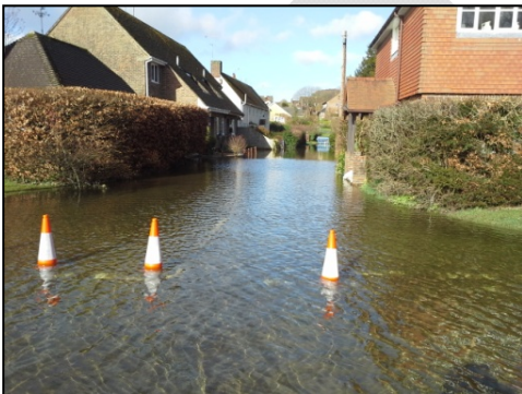
Groundwater flooding (FLOD)