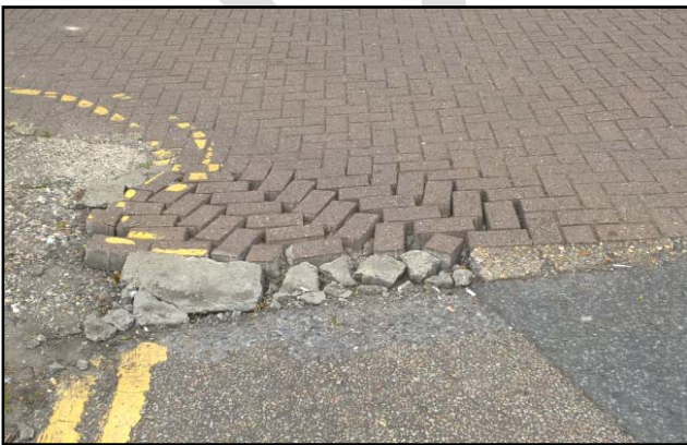
Footway trip, slab profile/rocking slab (SLPF)