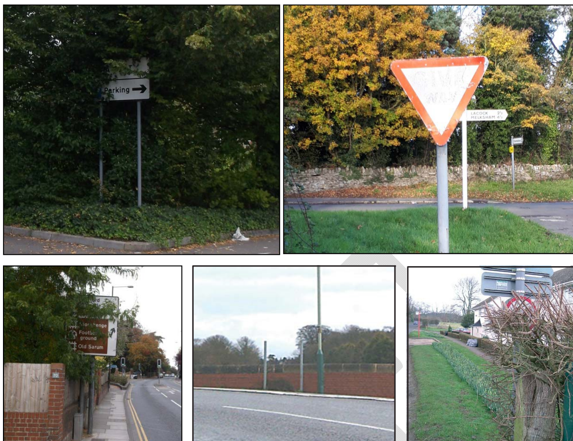
Signs illegible because of, dirt (DIRT), turned or obscured (OBSG) or missing (MISS)