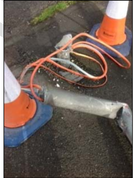
Damaged electrical installations and equipment (LIGH)